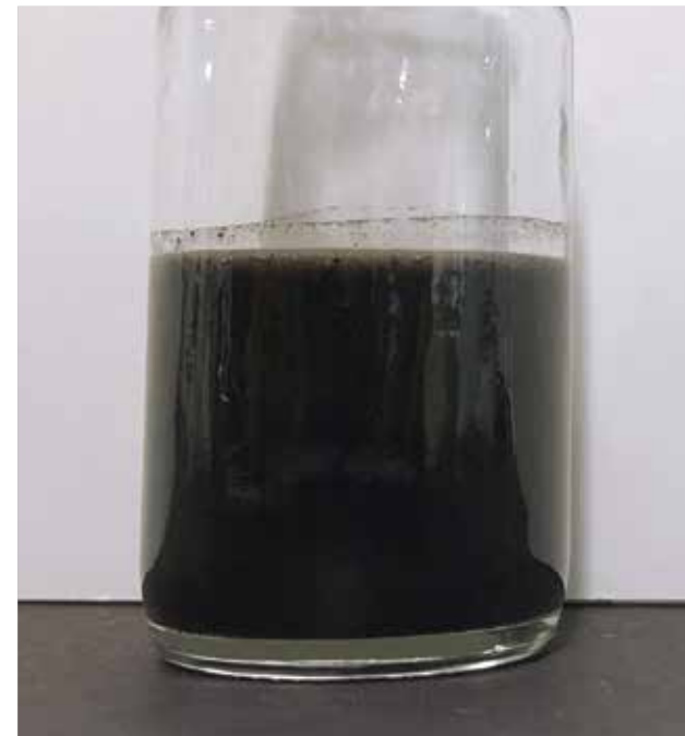
Readily and easily dispersible in water-based fluids

For additional technical information on LAPONITE rheology additives, and DISPERBYK wetting and dispersing additives please refer to www.byk.com .