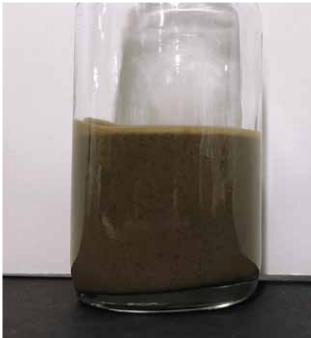
Readily and easily dispersible in oil-based fluids