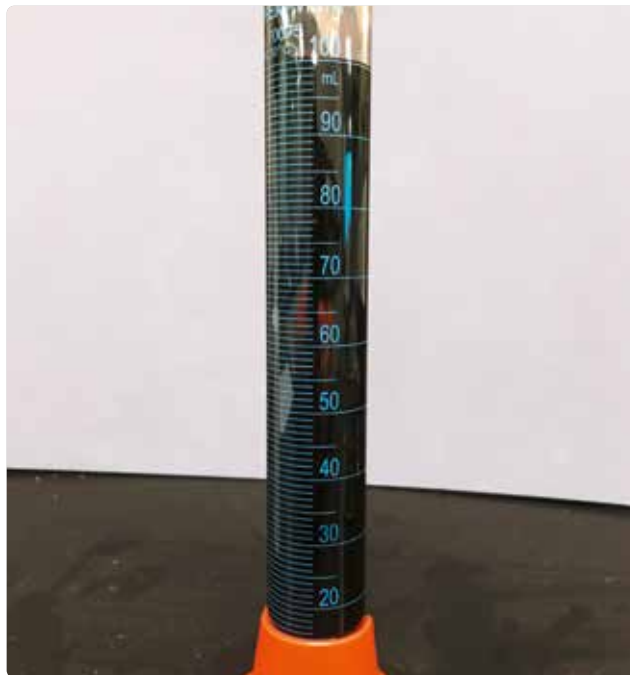
No fluid separation or settling observed over four weeks.