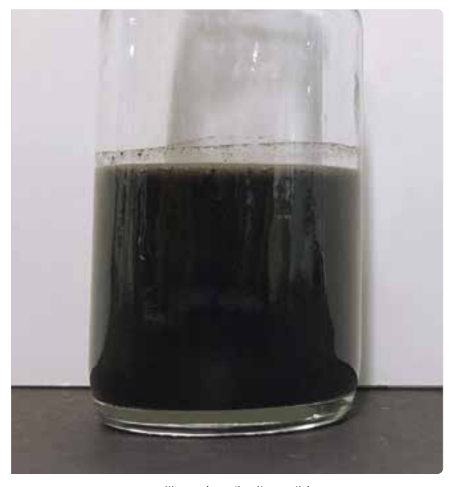
Readily and easily dispersible in water-based fluids

For additional technical information on LAPONITE rheology additives, and DISPERBYK wetting and dispersing additives please refer to <a href="https://www.byk.com">www.byk.com</a>.