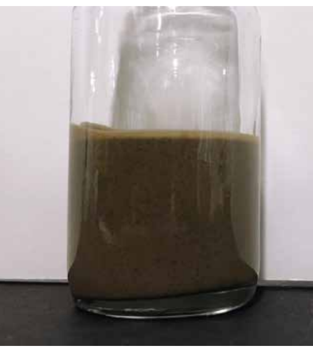
Readily and easily dispersible in oil-based fluids